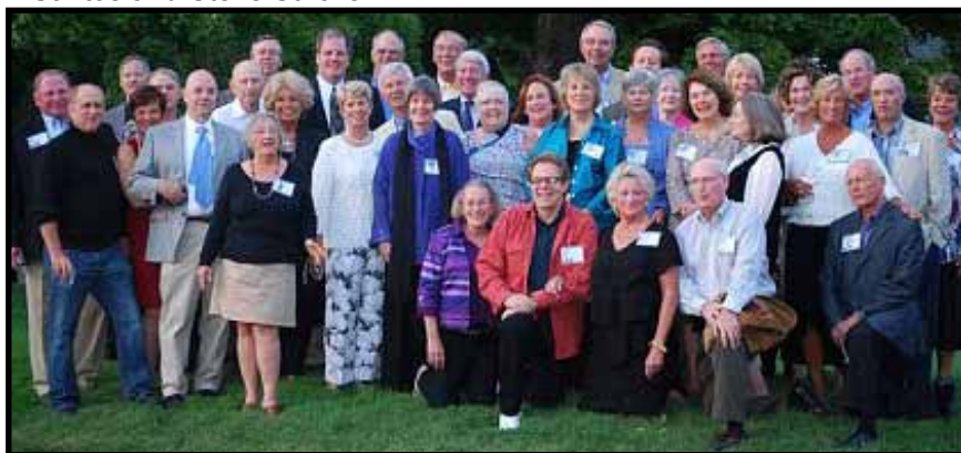
Class of 1965 Reunion Group Picture